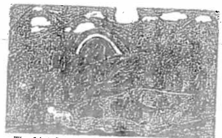
The 21st Contest Honorable Mention Winners "Forest Family"