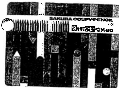
The Gold Prize Winners will be given Sakura-Cray-Pas Coupy Pencils (60 Color Set)

*All the prize winners and the participating organizations will be given "The Contest Commemorative Book of Winners".